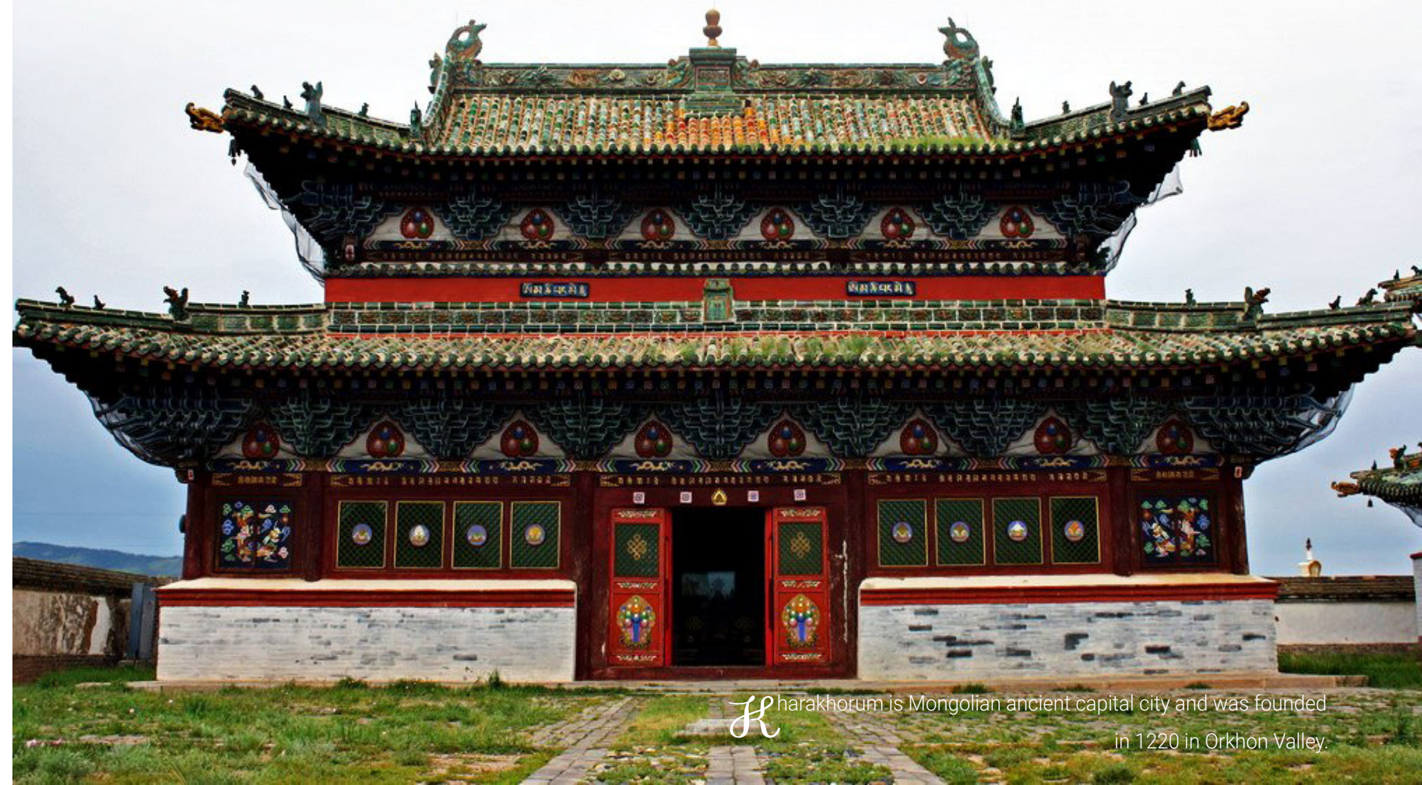
Kharakhorum is Mongolian ancient capital city and was founded in 1220 in Orkhon Valley.